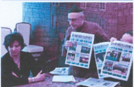
Awaiting an Answer to an Important Question December 15, 2015