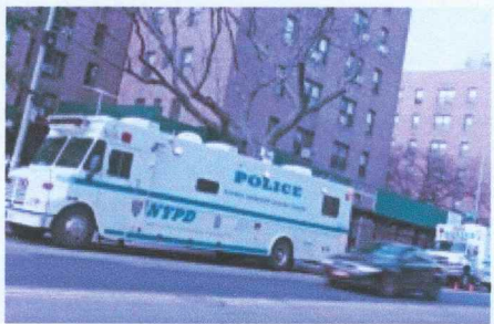
NYPD Steps Up Presence Following Forest Hills Fires December 17, 2015