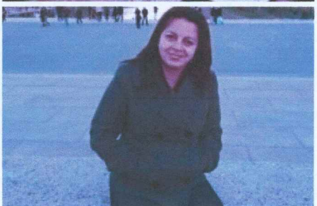
Another Death Rattles Hamptons Hispanic Community December 9, 2015